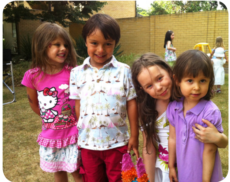
Blue smarties or repeated attempts to pin the tail on the donkey?