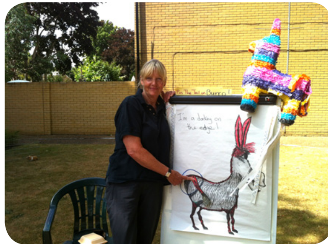
It's a donkey on the edge!